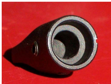
Knob with Recessed Opening (dimmer shaft plugs into hole in center- this is the back of the knob)

When you buy the potentiometer, select a knob style you like which fits the shaft (typically ¼ inch) yet make sure the knob has a recessed opening which can cover the mounting threads of the pot once installed.